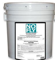
NoFly WP 20 lb pail